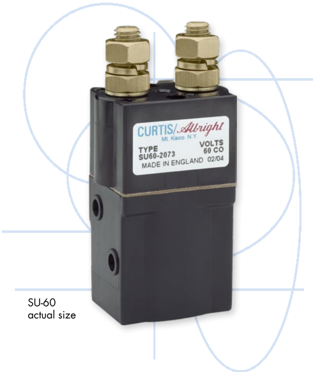
SU-60 actual size